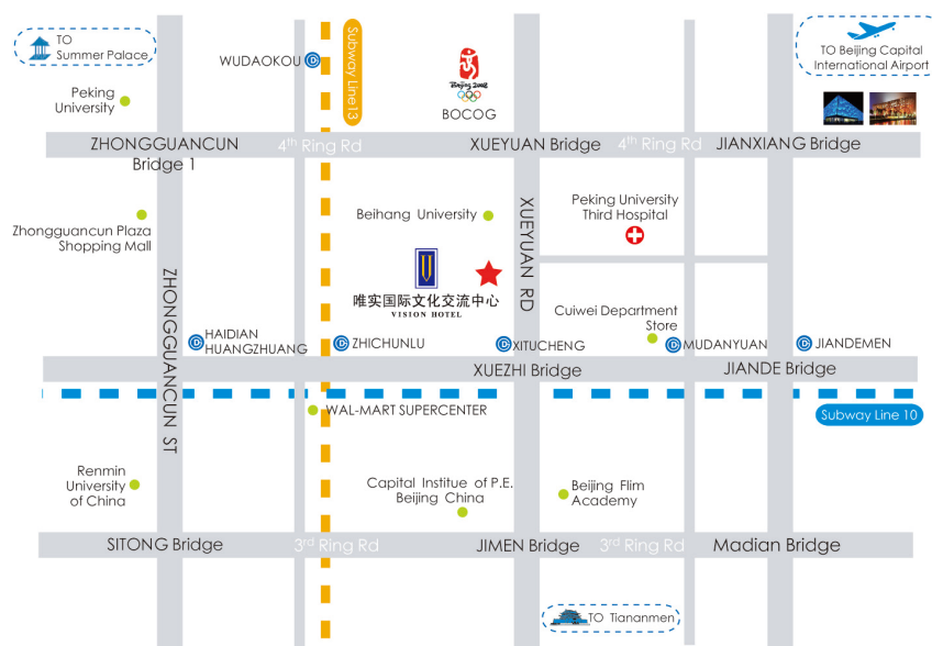
Vision Hotel Map

Transportation to Vision Hotel by Subway: Take the Airport Express at Beijing Capital International Airport and transfer to line 10 at Sanyuanqiao Station . Please stop at Xitucheng Station , and find Exit A to get out the subway.