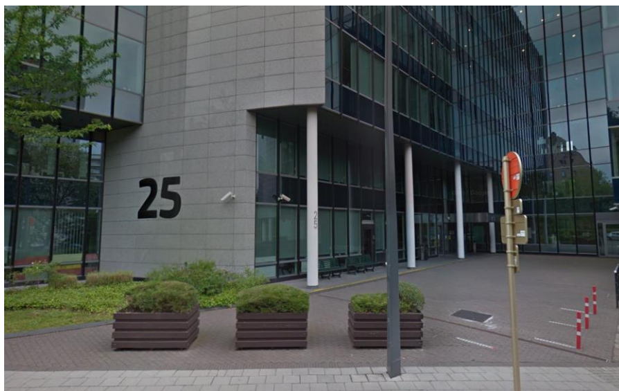
Photo of the Venue